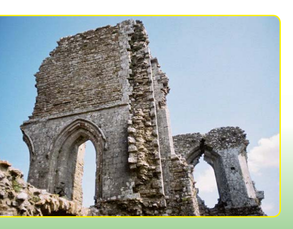
Ruins of the 12th Century Castle at Llansteffan.

For the ambitious experienced walker why not ascend the heights of Mount Snowdon, at 3,560ft the highest peak in Wales, from the summit, under clear conditions splendid views are always a thrill worthy of the climb.